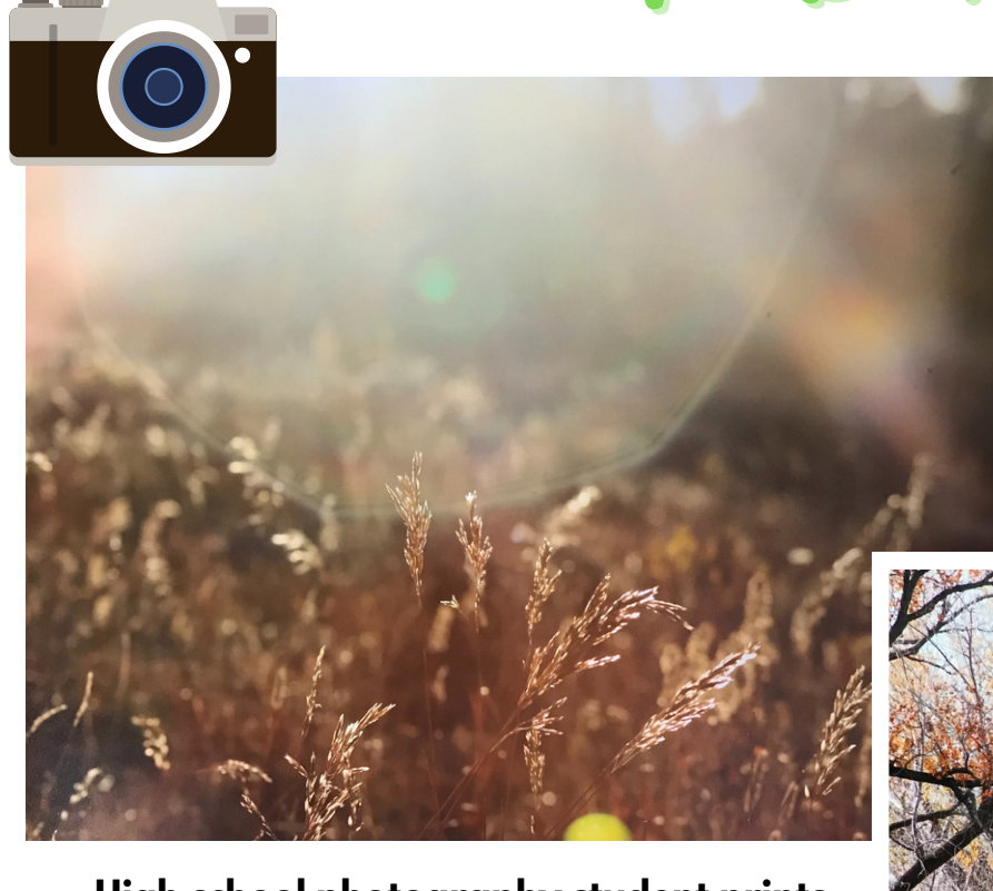
High school photography student prints