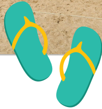
High School Retreat