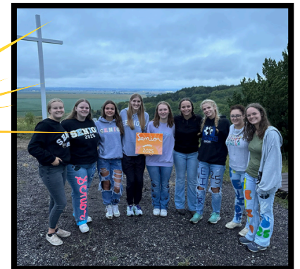
The Senior Class met at sunrise the day before school started to pray over the year!