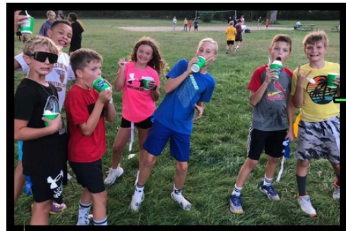
Back to School Park Social