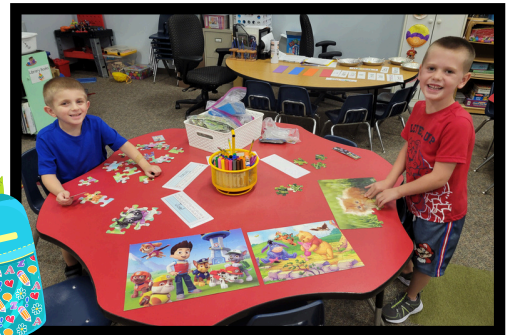
Kindergarteners enjoying centers!