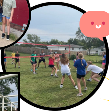
Middle School Retreat