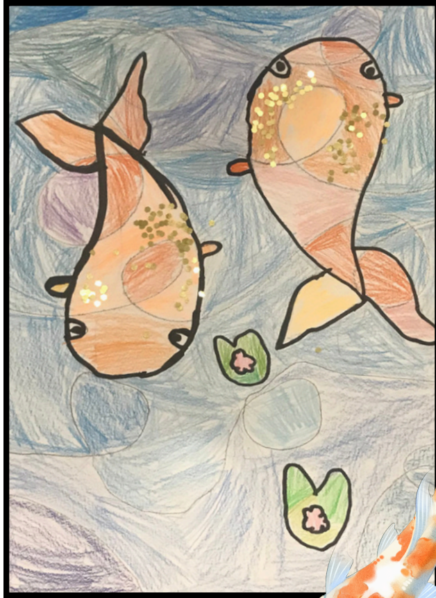
1st Grade Koi Fish Abstract Art