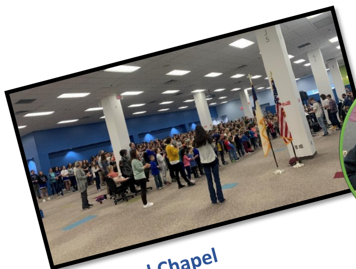
All School Chapel