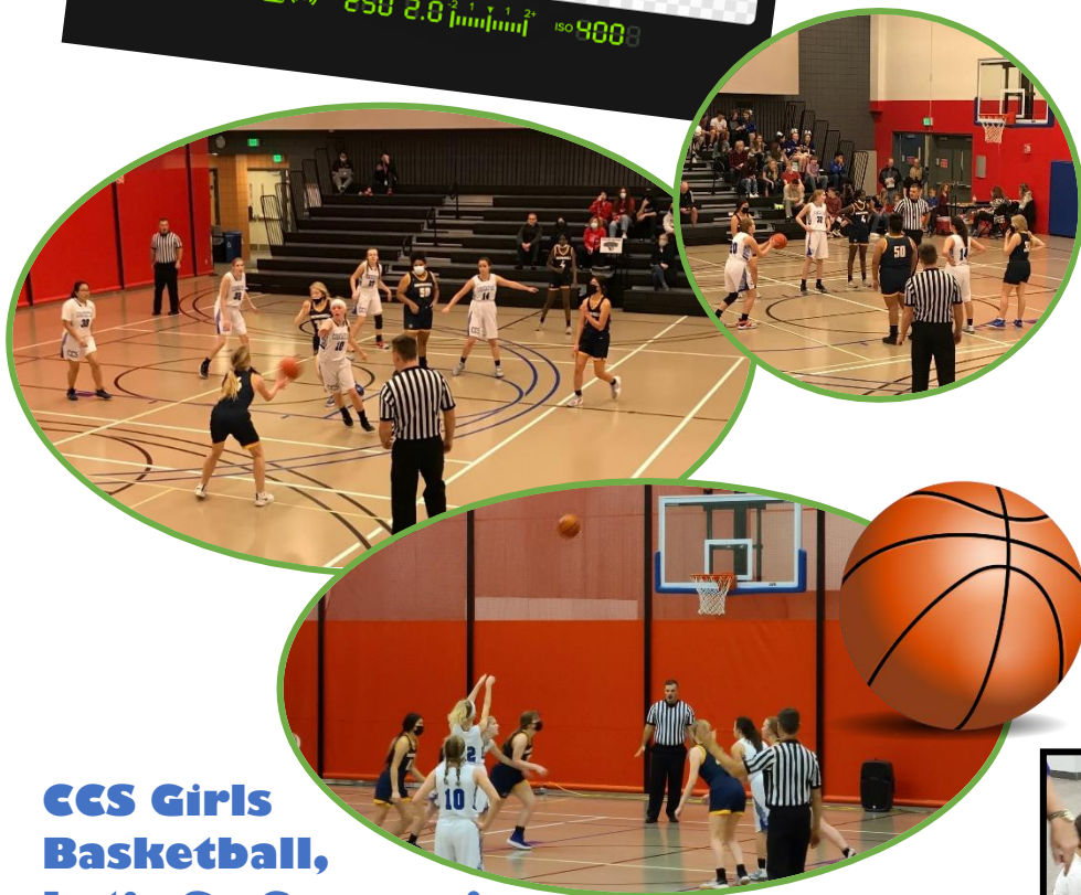
CCS Girls Basketball, Let's Go Cougars!