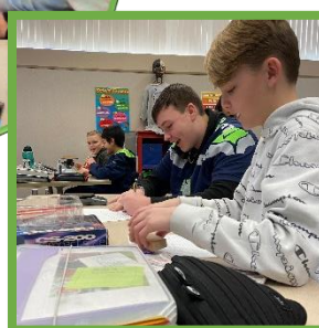
Middle School Studies!