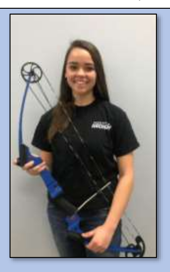
Middle School Archery Team