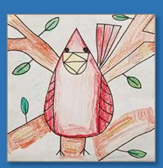
K - Cardinals, 1st grade - Burrowing Owls, 2nd grade - Black & White Warbler, 3nd grade - Blue Jays, 4th grade - Pileated Woodpecker, 5th grade - Great Blue Heron