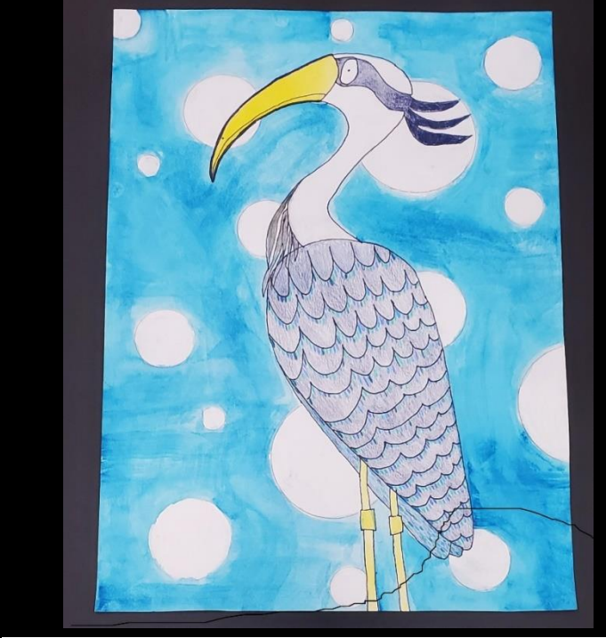
5<sup>th</sup> grader, Zach Moseley, won Best in Show for grades 5-8