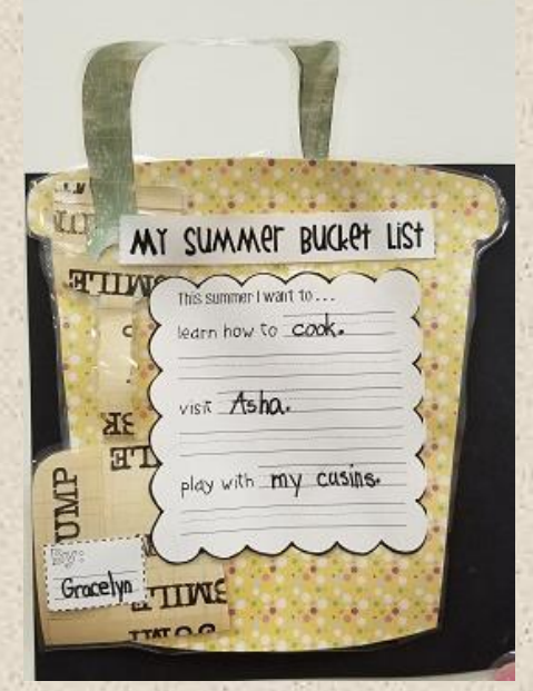
I want to learn how to cook.

Here are a several summer bucket goals from our Kindergarten students.