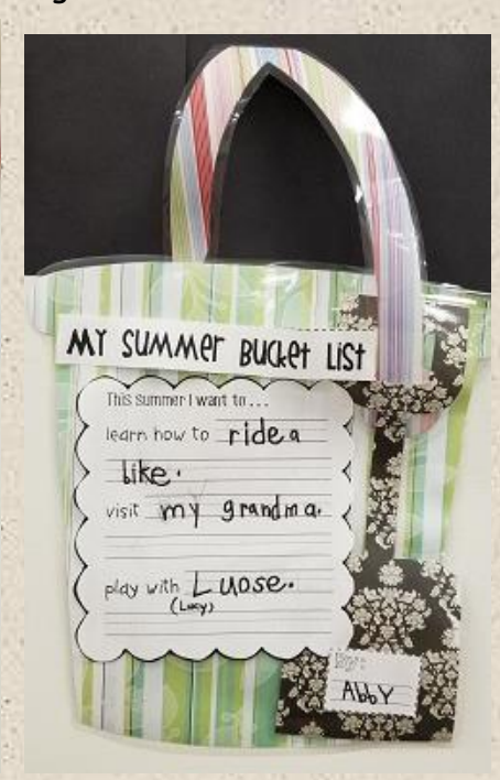
I want to learn how to ride a bike.