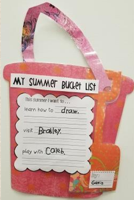
I want to learn how to draw.