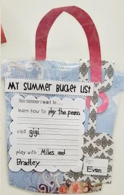
I want to learn how to play the piano.