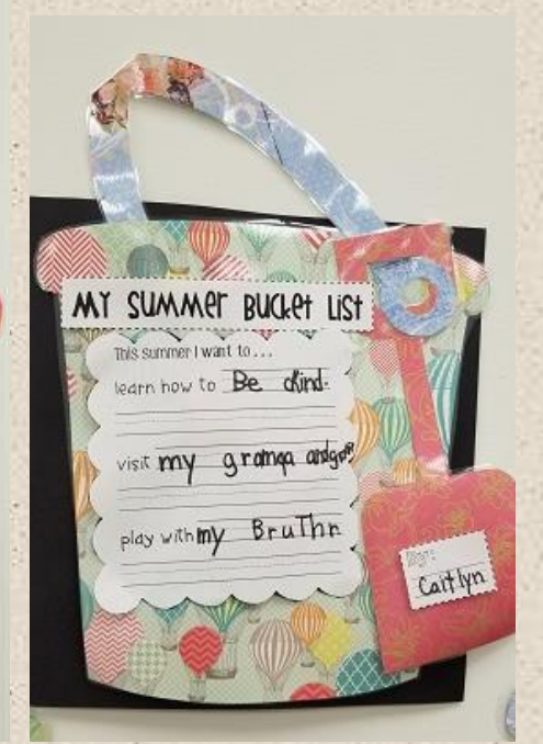
I want to learn how to be kind.