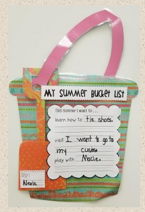
I want to learn how to tie shoes.