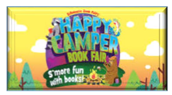
September 24<sup>th</sup> - 28<sup>th</sup>

Cornerstone Christian School provides after-school care for our elementary & middle school students. The program is from 3:20 to 5:30 and includes homework time, crafts, snacks, and activities. Call the office to register your child(ren)for the daily fee of $8 per child. Drop-in rate is $9 per day.