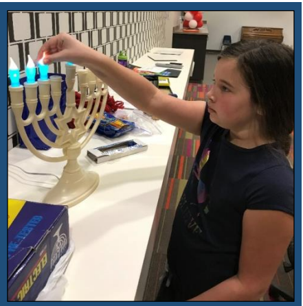
Festival of Lights – by Lisa Binko

The fourth graders celebrated The Festival of Lights called Hanukkah. They learned about the victory of the Maccabees and the miracle of the oil that burned for 8 days. The students were challenged to shine the light of the love of Jesus as they prepare for their Christmas holiday.