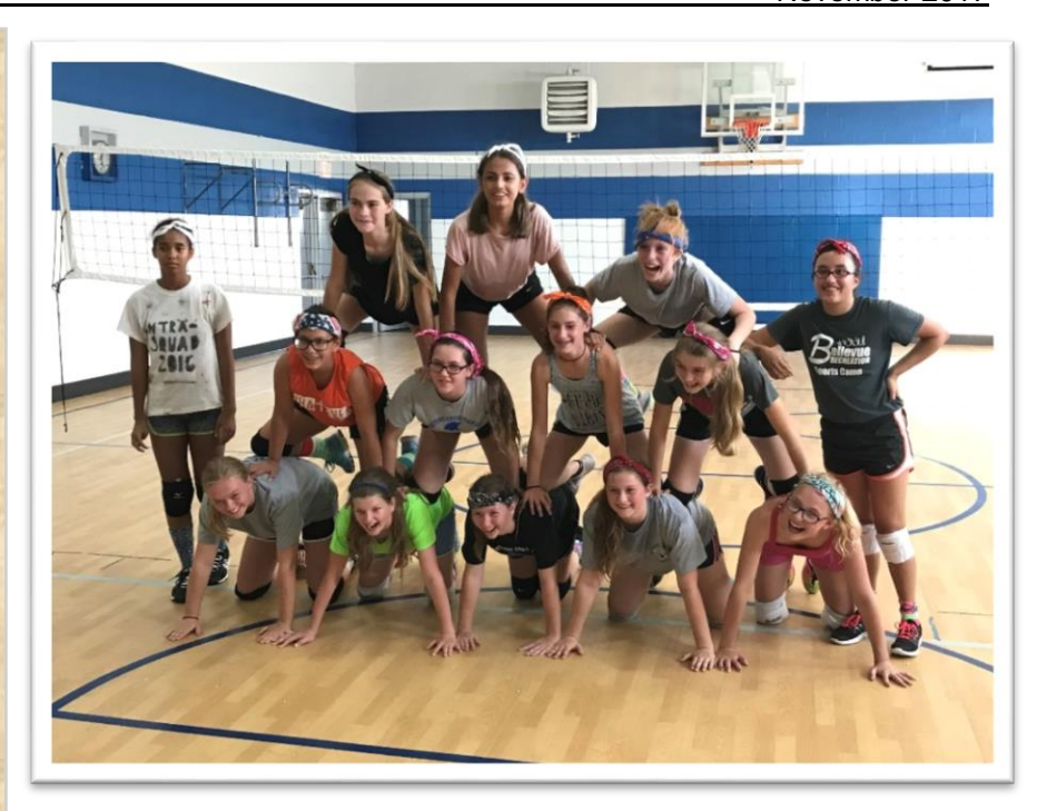
A & B 8<sup>th</sup> Grade Volleyball Teams