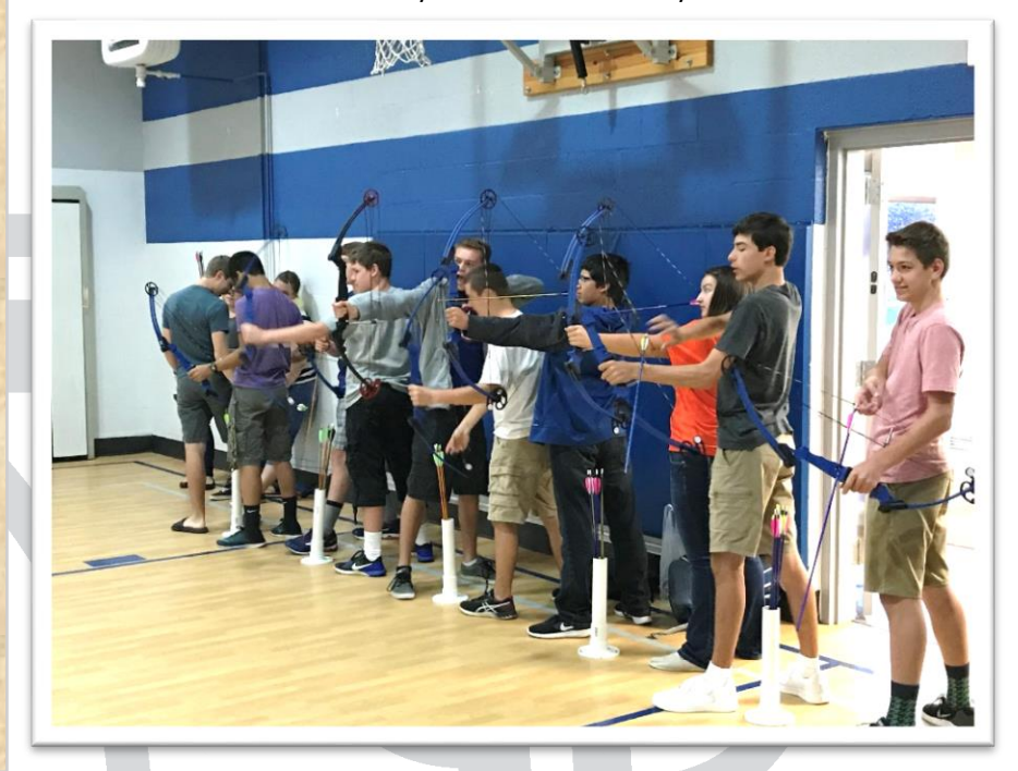
High School Archery Team Practicing their shots