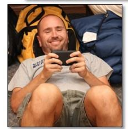
CCS High School Retreat August 2014