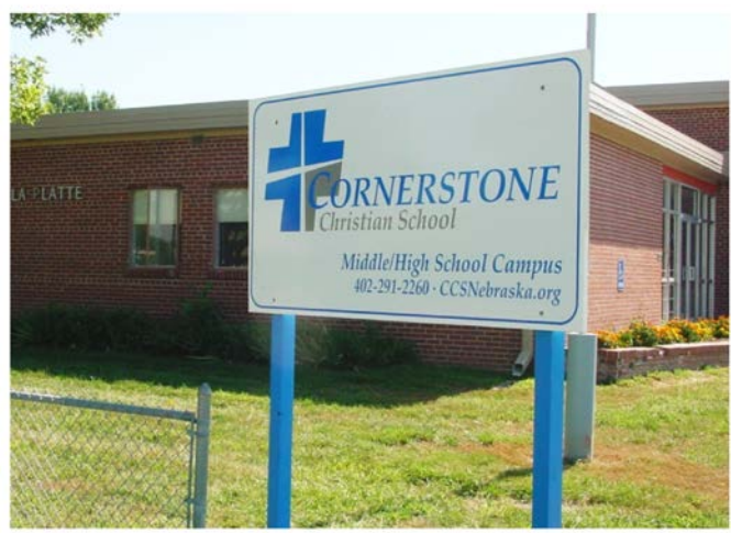
A new sign was installed this summer near the front entrance of Cornerstone Christian School Middle/High School.