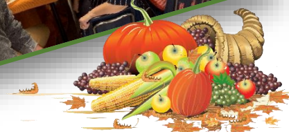
High School Staff enjoy a Thanksgiving feast prepared by the Family Consumer Science Students!