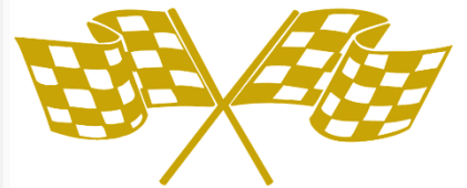
3 rd Grade Roller Derby Voting and Competition!