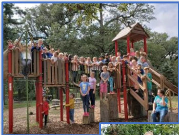
3 rd Grade Arbor Farm Field trip!