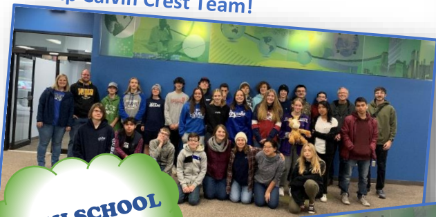
HIGH SCHOOL MISSIONS