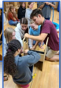
High Hopes Work Day