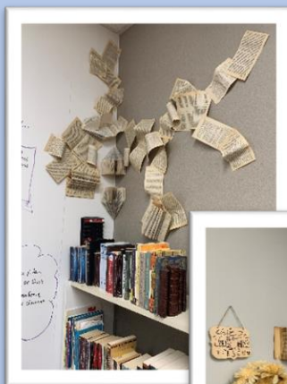
TEACHER'S GET CREATIVE WITH...