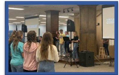
HIGH SCHOOL CHAPEL