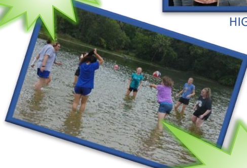
HIGH SCHOOL RETREAT!