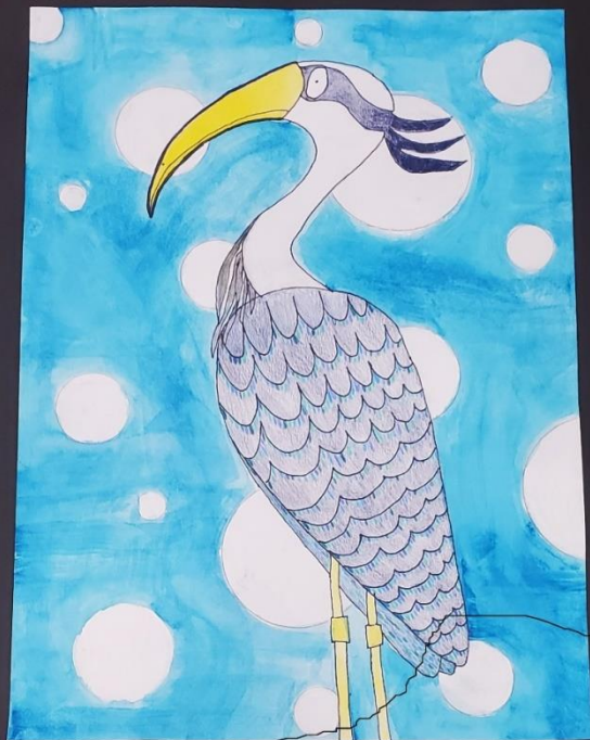
5 th grader, Zach Moseley, won Best in Show for grades 5-8