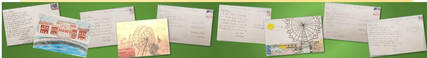
(More post cards and Bio poems are posted outside the computer classroom).