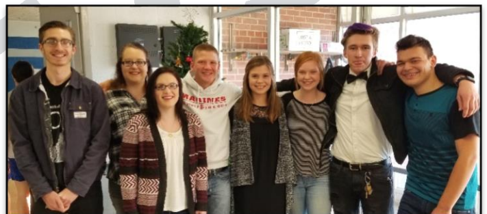
On Thursday, November 30 we were delighted to have several Cornerstone Alumni join us for chapel.

Friday, December 8, 7:00 PM Pre-K – MS Campus Free Admission