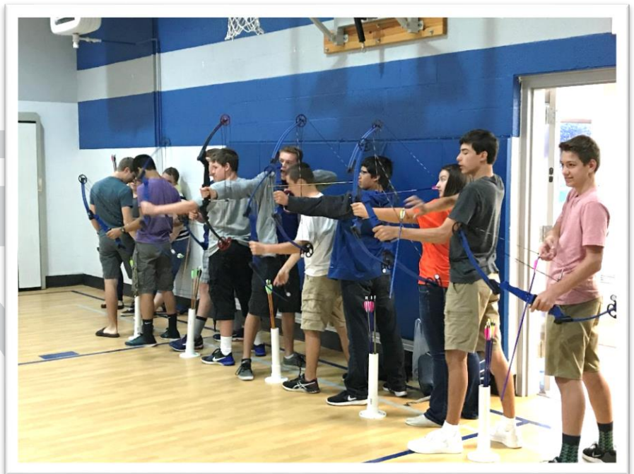
High School Archery Team Practicing their shots