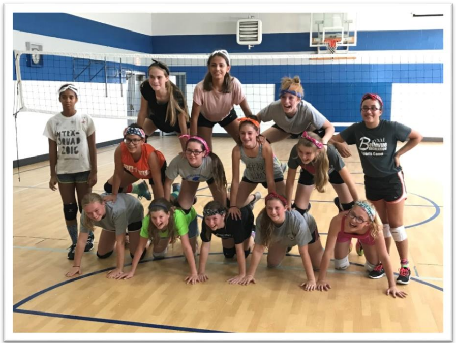
A & B 8 th Grade Volleyball Teams