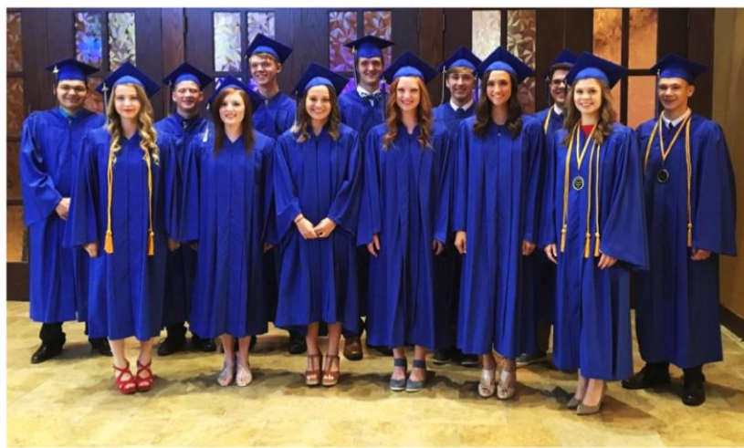
2017 Graduating Class