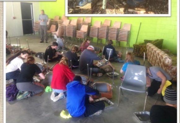
High School Missions Trip Stateside 2016