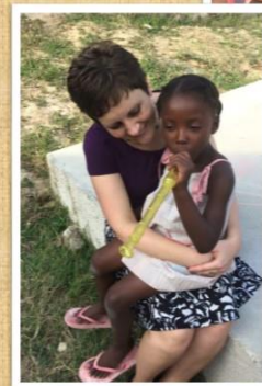
High School Missions Trip Haiti 2016