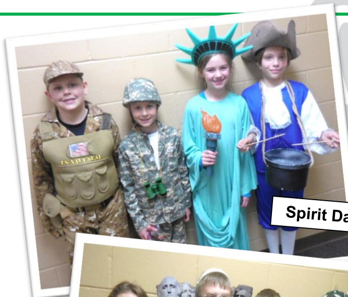
Spirit Days Photos!

The PTF will be hosting a Scholastic Book Fair at the Spring Program, April 15 th and the Drama Club Presentation, April 18 th . You may shop for books before and after the programs. This book fair will help with new book purchases for the libraries at both campuses. You may shop the online book fair sale as well.