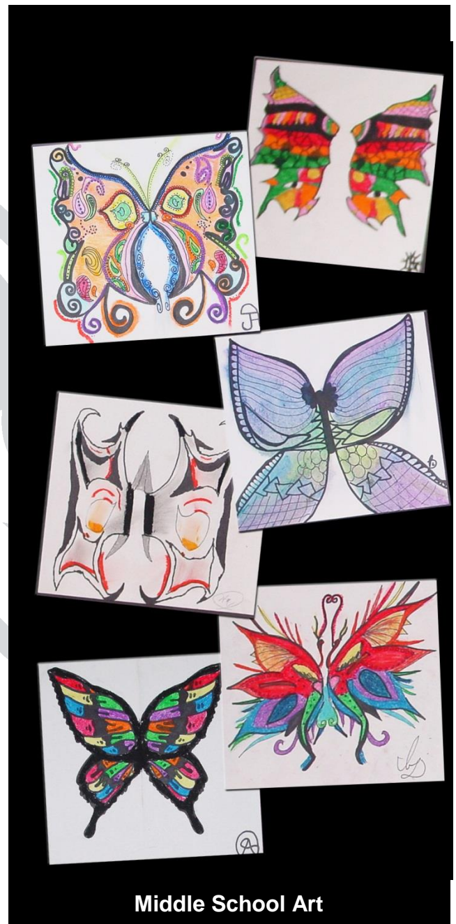
Middle School Art